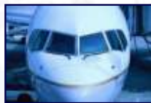
USTDA Has Applied Successful Technical Assistance Programs in Aviation Safety