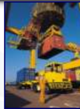
Modernizing Transportation Corridors is an Example of USTDA's TCB Assistance