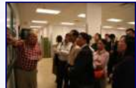
China Agricultural Biotechnology Training