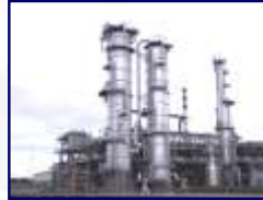
USTDA funded investment analysis associated with this isomerization project in the Philippines.