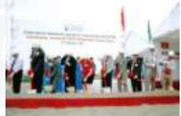
USTDA assistance led to this groundbreaking for a solid waste treatment complex in Vietnam.