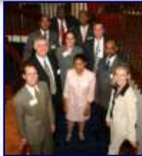
South Africa energy and power Orientation Visit