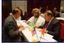
South Asia Communications Infrastructure Conference