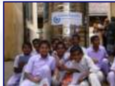
Tsunami Response: Delivering potable water to 100,000 Sri Lankan citizens.