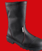
FREEZER BOOTS MÜNCHEN