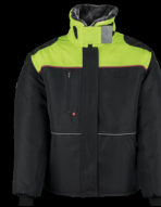
FREEZER JACKET ARCTIC