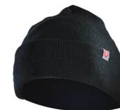
KNITTED CAP OSCAR