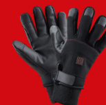
FREEZER GLOVE POWER GRIP