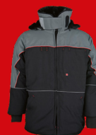
FREEZER JACKET POLAR