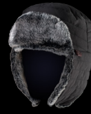
PROTECTIVE HOOD BJÖRN