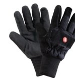
FREEZER GLOVES EAGLE