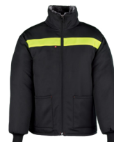
FREEZER JACKET SNAG