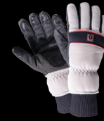
FREEZER GLOVE KEVLAR