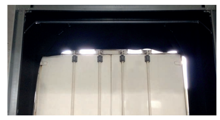
Ordinary dock shelters leave gaps where contaminants can enter your facility and expensive energy can escape.