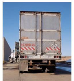
Eclipse NH dock shelter seals liftgate as well as standard over-the-road trailers.