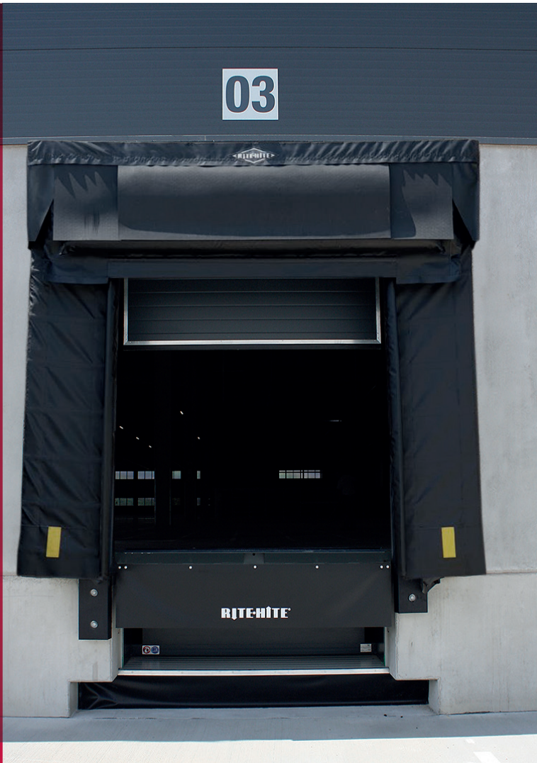
Rite-Hite ® Eclipse Dock Shelter.

The Eclipse shelter provides an advanced, highly effective seal at your loading dock.