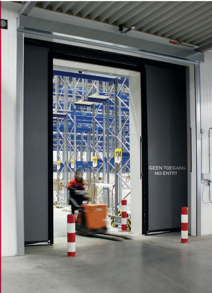
Rite-Hite Barrier® Glider Cold Storage Door

AGRO Merchants Group provides innovative cold chain solutions on a global basis by partnering with the highest quality family businesses and creating new, reliable, and integrated trade networks to help its customers grow. The company is investing in modern assets, industry leading technologies, and value-added service offerings to ensure the highest quality supply chain management standards in the industry.