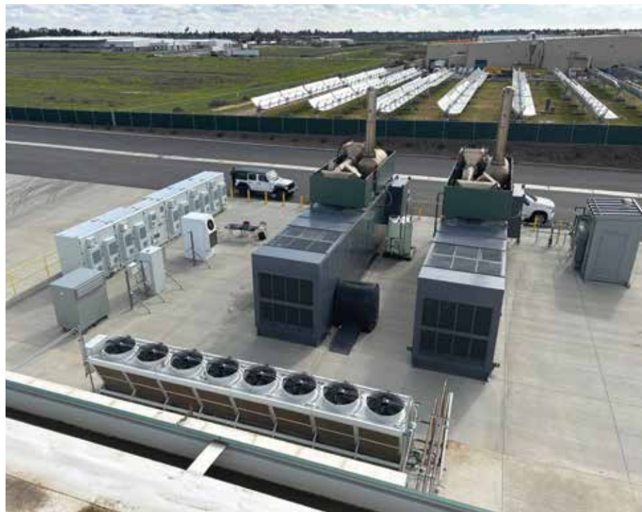
The line of white rectangular boxes to the left of the generators is a 4.8 MWh battery energy storage system.

"GCCA is actively engaged with government and power companies to discuss its policy recommendations."