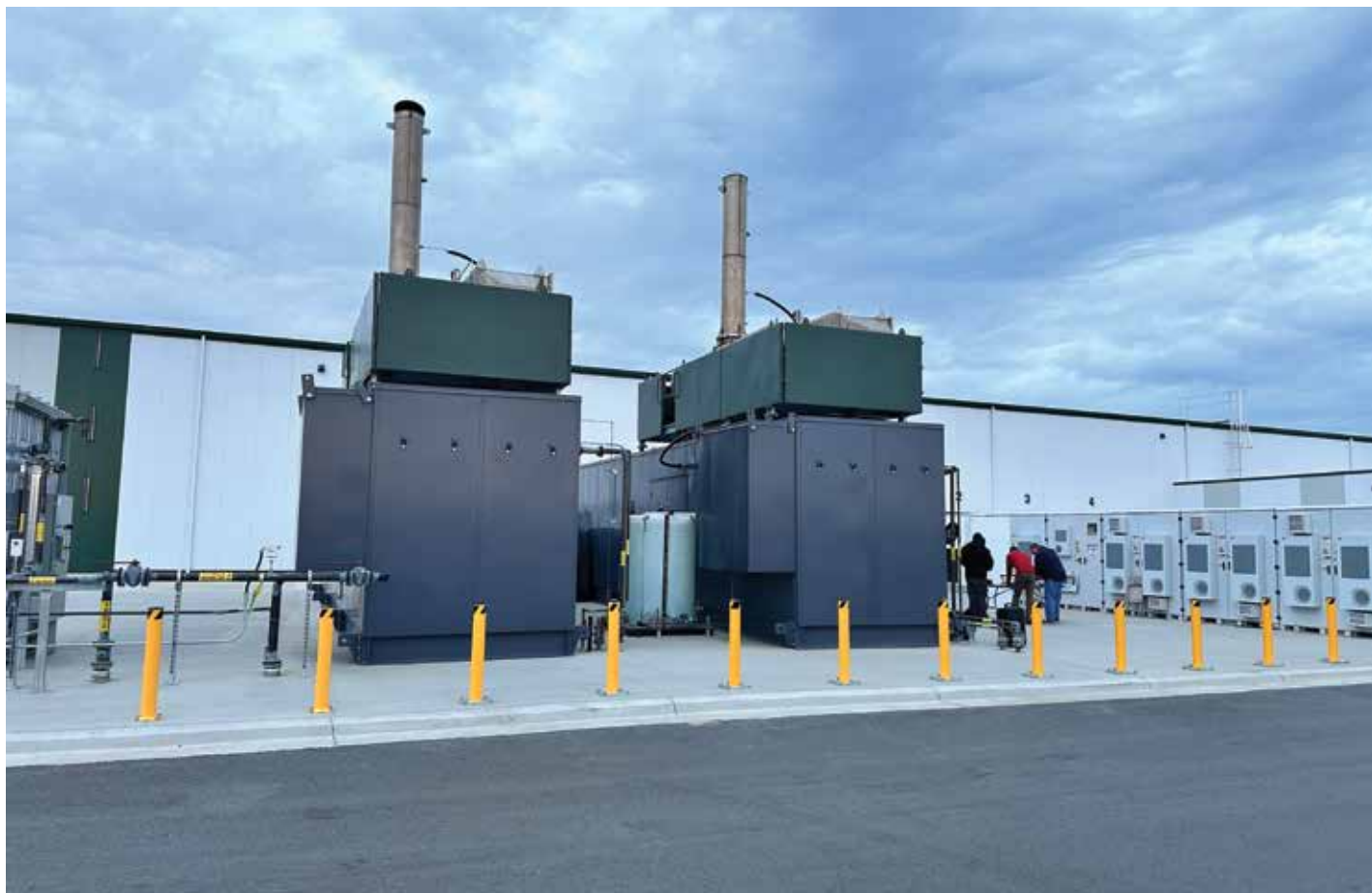
The two 4.8 MW low-emission generators.

and storage are insufficient to meet the facility's needs. The San Joaquin Valley Air Pollution Control District has granted permits for these generators, ensuring that their emissions are under required limits. The generators provide enough electricity to power the entire facility when needed. In normal circumstances, the generators alternate every few hours to allow for maintenance. If there is a sudden spike in the electricity demand, they're designed to be able to run simultaneously.