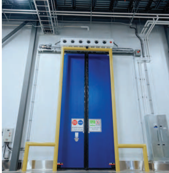
Left: The new Congebec facility is equipped with a loading dock providing access to 30 doors.