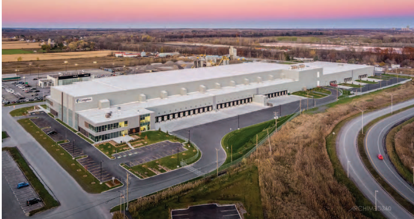
Attention to detail aligned to Canadian Food Inspection Agency (CFIA) standards resulted in one of the highest grades given by the CFIA on a Congebec new build.

the humidity level that you introduce into the building once you go from -18 C to 4 C without losing the integrity of your envelope and your roof system,” El-Koury says.