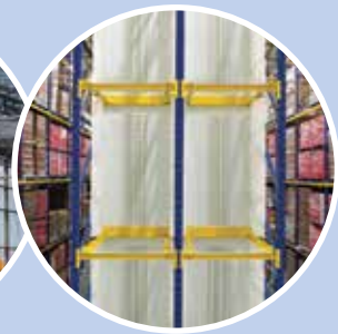
QFR ZONE® BLAST FREEZING

No other company combines the knowledge and experience in cold storage construction and warehousing that Tippmann Group offers. As owners & operators of more than 140,000,000 cubic feet of temperature-controlled space, Tippmann Group is your single source for cold storage excellence.