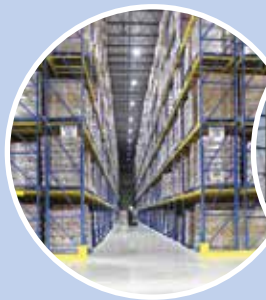
COLD STORAGE WAREHOUSING